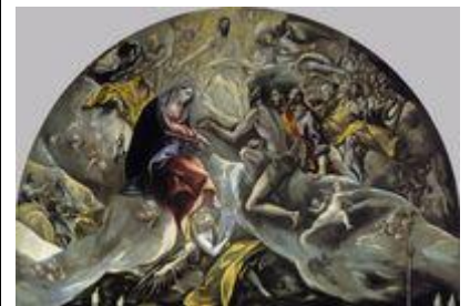
El Greco, Burial of Count Orgaz , Santo Tome, Toledo, Spain