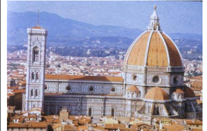
Brunelleschi’s dome atop Santa Maria del Fiore