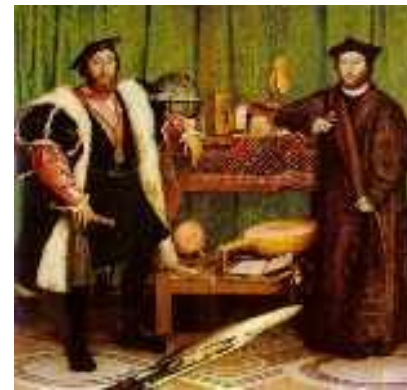
Holbein, The Ambassadors National Gallery, London