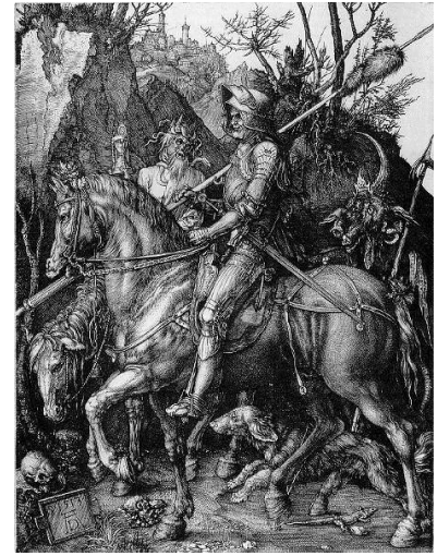
Dürer, Knight, Death and Devil , woodcut engraving