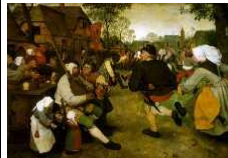
Brueghel the Elder, Peasant Dance Kunsthistorisches Museum Wien, Vienna