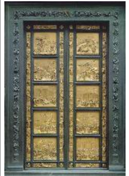
Ghiberti’s “gates of paradise”