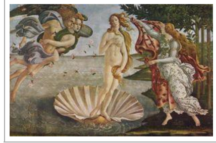
Botticelli, Birth of Venus , Uffizi, Florence