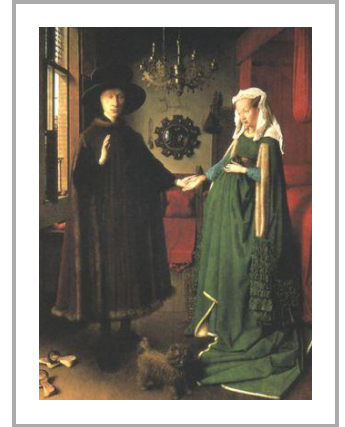
Van Eyck, Arnolfini and his Wife National Gallery, London