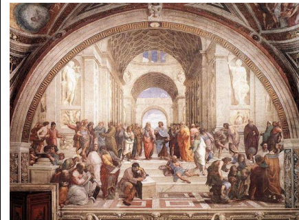
Raphael, School of Athens Palace of the Vatican, Rome