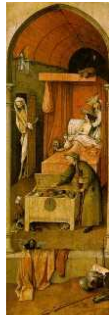
Bosch, Death and the Miser National Gallery, Washington, D.C.