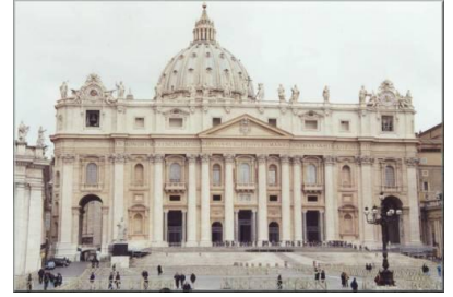
St. Peter's Basilica, Vatican City